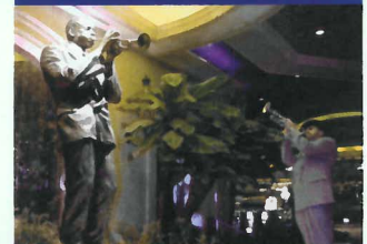
New Orleans - "Birthplace of Jazz"