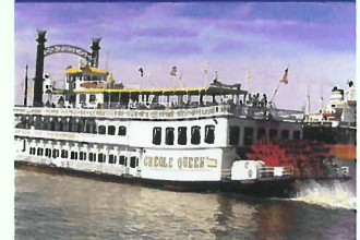
Enjoy a Riverboat Cruise