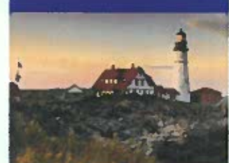
See the Portland Head Lighthouse

Departure: Holiday Cruises and Tours, 2522 Capital Circle NE, Tallahassee, FL @ 8 am