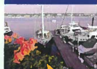
Enjoy the historic Portland Waterfront