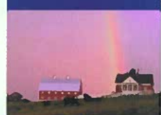
Visit the picturesque Pineland Farms