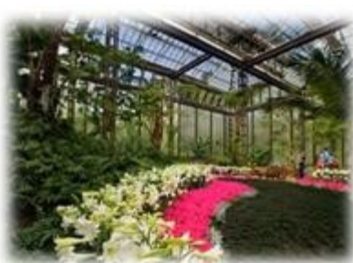
Sibley Horticultural Center