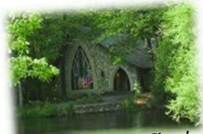
Callaway Memorial Chapel