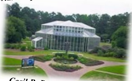
Cecil B. Day Butterfly Center