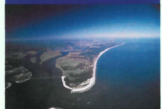
Aerial view of Amelia Island