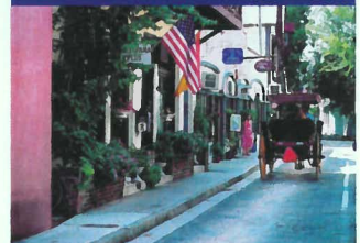
Historic St. George St