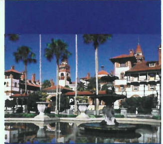
St. Augustine, our Nation's Oldest City