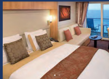
Veranda Stateroom from $2797.60 pp*

*Prices are per person, based on double occupancy.