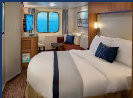
Ocean View Stateroom from $2506.60 pp*