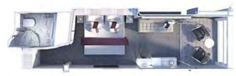
Infinite Veranda Stateroom from $3876.21 pp*