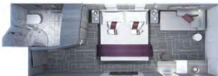
Inside Stateroom from $2656.91 pp*