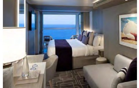
360° Virtual Tour