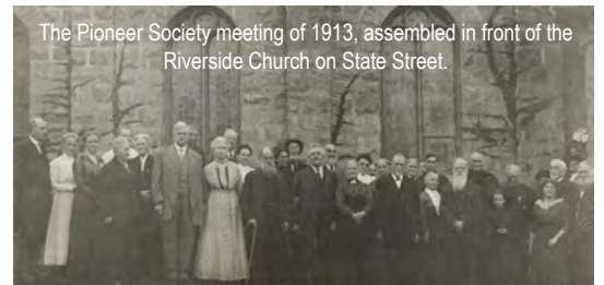
The Pioneer Society meeting of 1913, assembled in front of the Riverside Church on State Street.

The History Museum of Hood River County is a vibrant center for engaging all people in a better understanding of our community's heritage that preserves the past, relates it to the present and shapes our future. It began with avid collectors of local stories, the 1907 Pioneer Society later morphed into The History Museum of Hood River County. Created in 1978, The History Museum is an active participant in its vibrant multi-cultural community and is led by the Heritage Council, a 501c3 non-profit organization. The Council members are a diverse group who have many cumulative years of experience in education, law, business, retail, social work, government organizations, the arts, historic research, and various other local community cultural and governmental entities. The non-profit Museum brings the region's past and present to life through permanent displays, temporary exhibitions, and programs. The museum holds in trust over 30,000 artifacts, documents, and media that represent the diverse heritage of Hood River County and the Columbia Gorge. We bring to life the stories of all the peoples of this region through education, discussion, and exhibitions. Celebrating and embracing the Hood River County and the mid-Columbia River Gorge area's diverse cultural heritage, preserve its unique story, and continuing to encourage the value of understanding how history shaped the past, impacts the present, and influences the future.