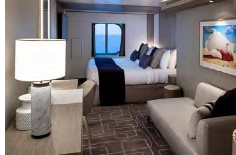
360° Virtual Tour