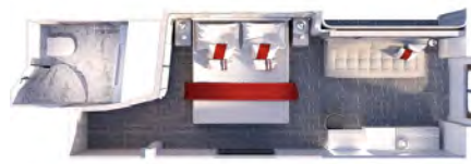
Oceanview Stateroom from $2846.91 pp* *Double occupancy