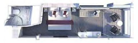
Concierge Veranda Stateroom from $3720.91 pp*