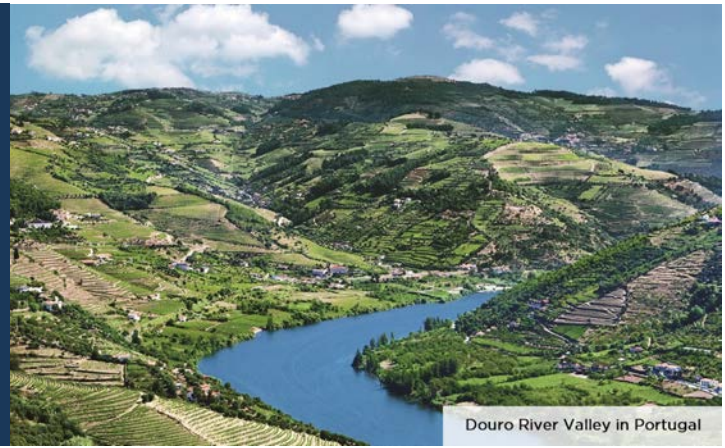
Douro River Valley in Portugal