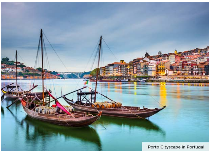
Porto Cityscape in Portugal