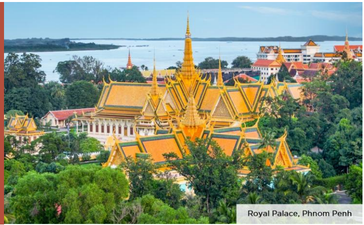
Royal Palace, Phnom Penh

December 14-21, 2026 | AmaDara 7-night cruise from My Tho Port to Kampong Cham