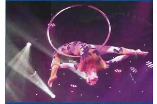
"ARRAY" - Pigeon Forge's Newest Variety Show