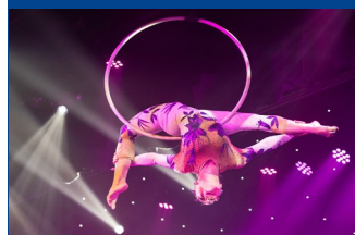
"ARRAY" - Pigeon Forge's Newest Variety Show

Day 5: Today after enjoying a Continental Breakfast, you depart for home... a perfect time to chat with your friends about all the fun things you've done, the great shows you've seen, and where your next group trip will take you!