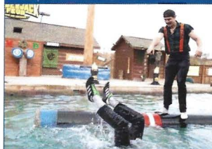
PAULA DEEN'S LUMBERJACK FEUD SHOW