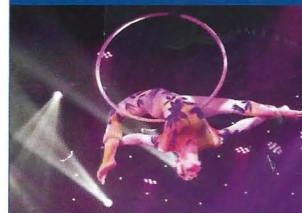
"ARRAY" - Pigeon Forge's Newest Variety Show