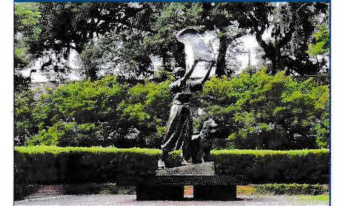
Savannah - the "Belle of Georgia"