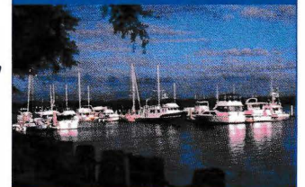
Beaufort, SC - "Queen of the Carolina Sea Islands"