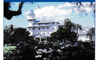
Jekyll Island - Georgia's elite coastal barrier island