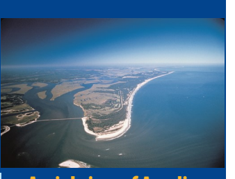
Aerial view of Amelia Island